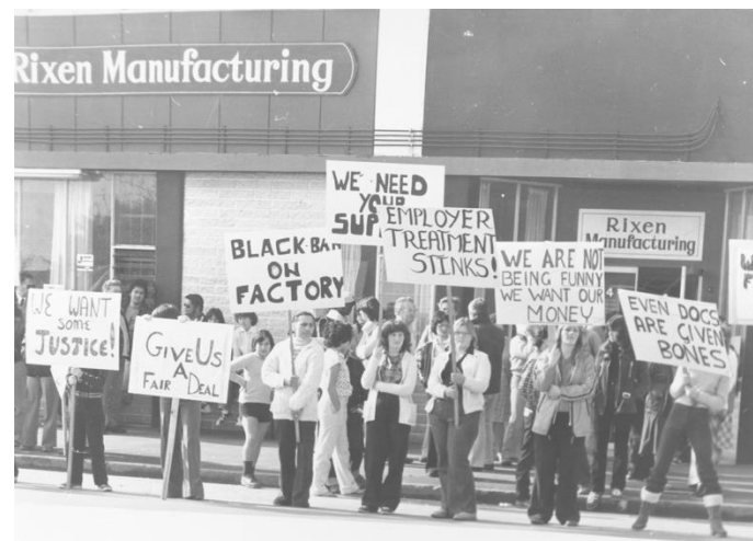
Rixen occupation, Levin 1981