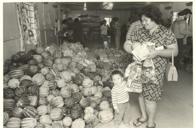
Kinleith strike welfare centre, Tokoroa 1980