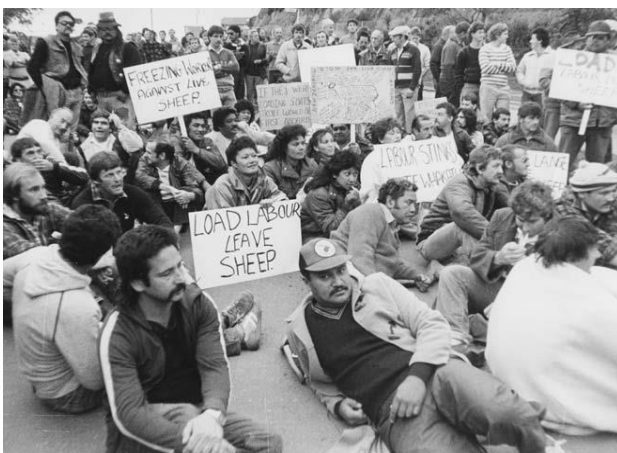
NZ Meat Workers' Union picket of Timaru wharves during 1986 national strike